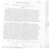
1: Naval Attaché. General situation in