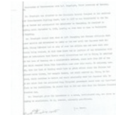
5: Naval Attaché. Memorandum of