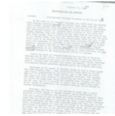
4: Naval Attaché. Sino-Japanese