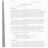
2: Naval Attaché. Report on Japan's