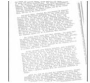
6: U.S. Marines. Sino- Japanese