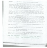
3: Naval Attaché. Situation in