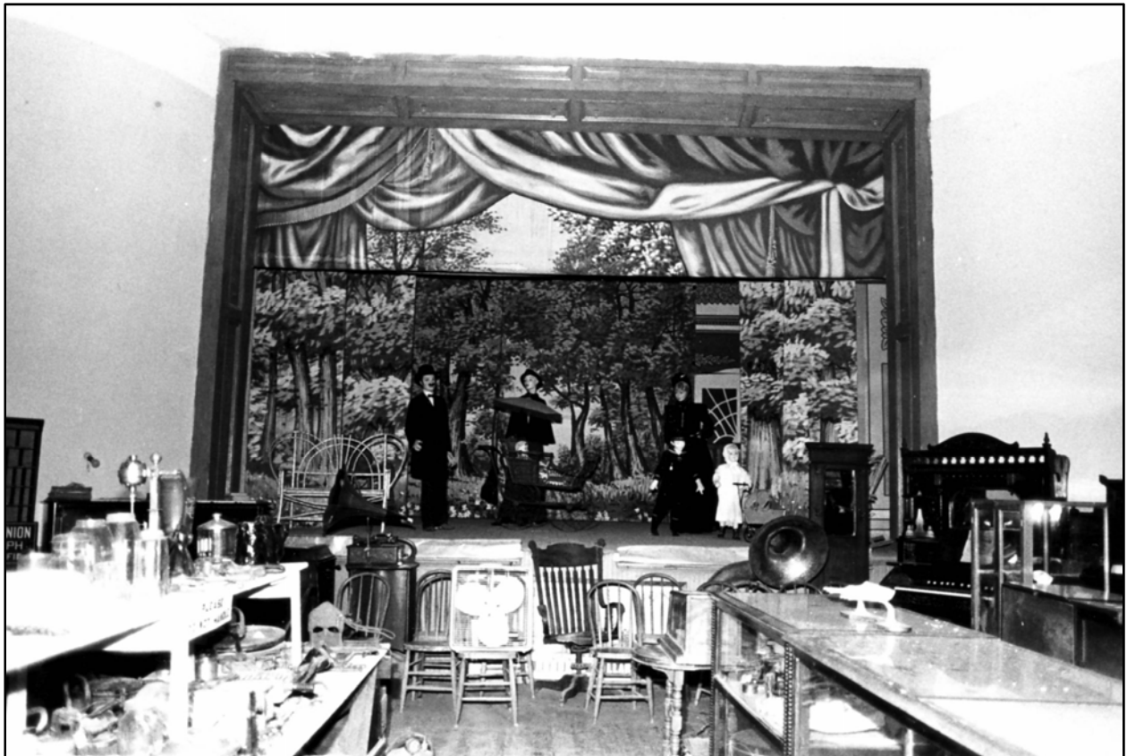
View looking west at stage Photo by Christian H. Ehlers, 11-29-86 (NSHS 8611/5:33)