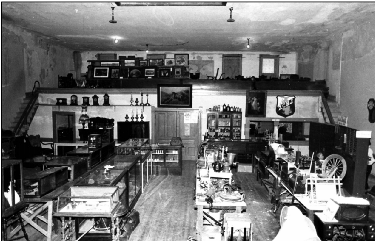
View looking east at auditorium area from the stage Photo by Christian H. Ehlers, 11-29-86 (NSHS 8611/5:37)