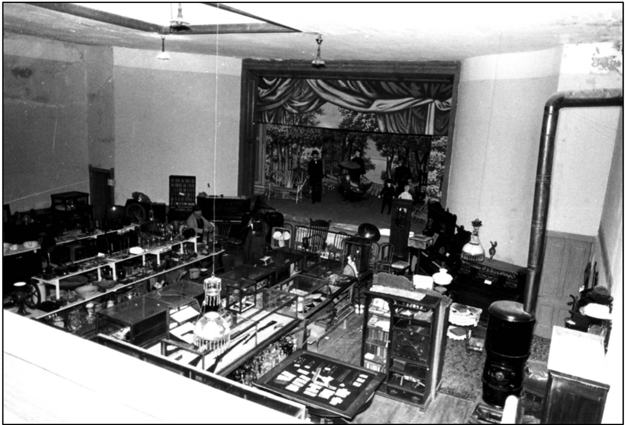
View looking west southwest at stage area from balcony 11-29-86 (NSHS 8611/5:30)