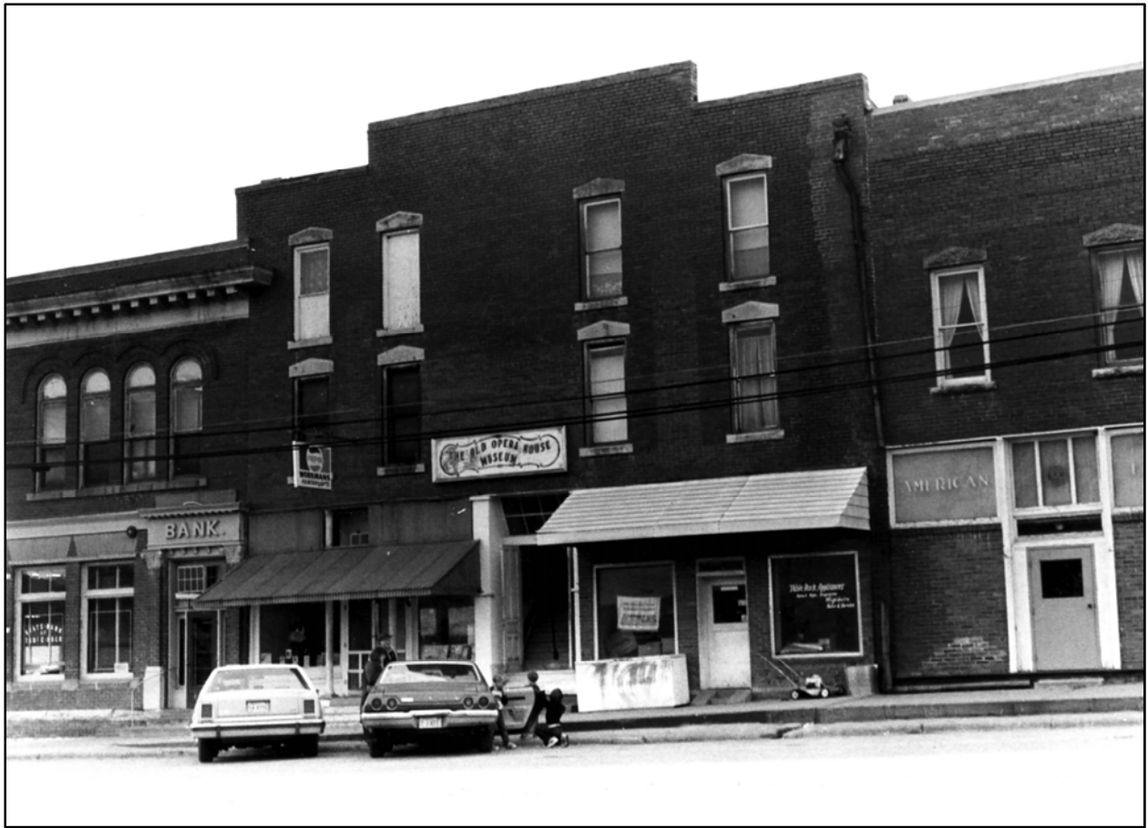
View looking southwest at east (front) façade Photo by Christian H. Ehlers, 11-29-86 (NSHS 8611/5:26)