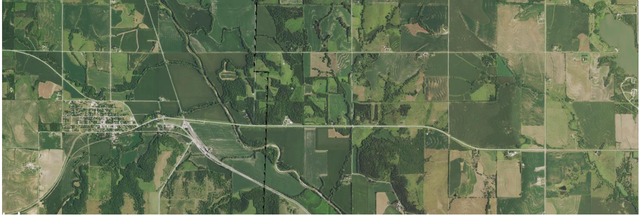
Table Rock; the original town is enclosed within highways, somewhat resembles the state of Nebraska, with the cemetery at the bottom of the panhandle (left). The Table Rock Cemetery is at the left.

Table Rock, to the left in the photograph; the North Branch of the Big Nemaha River is the curvy line east of town.